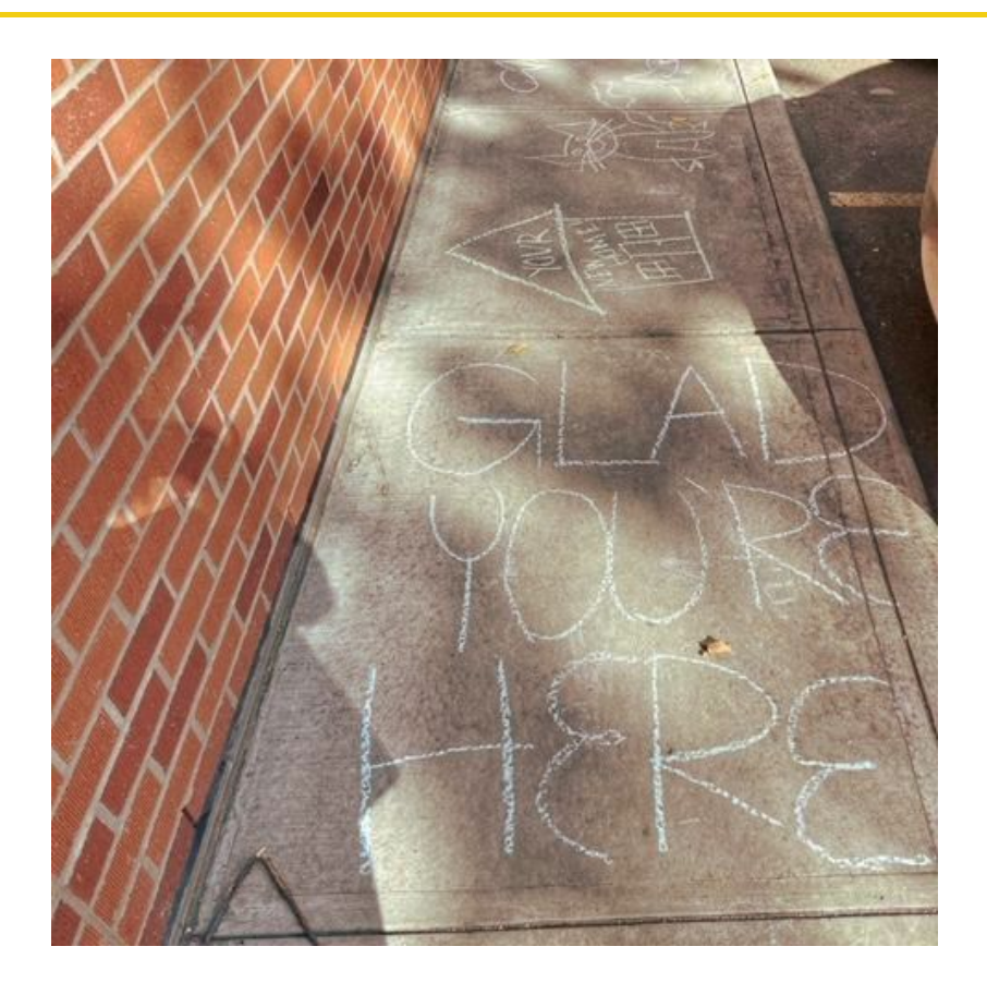
Sidewalk chalk drawings welcoming SJC Residents to campus.

National Day for Truth and Reconciliation September 30, 2021