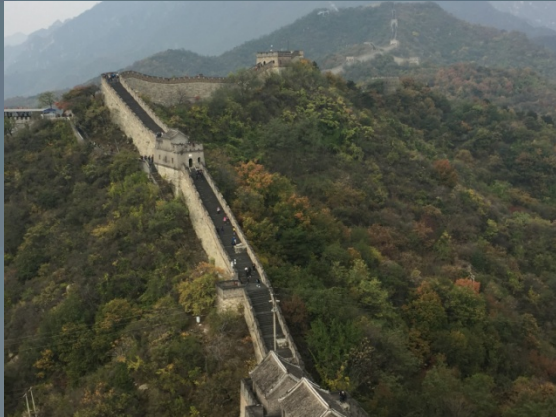
Great Wall of China