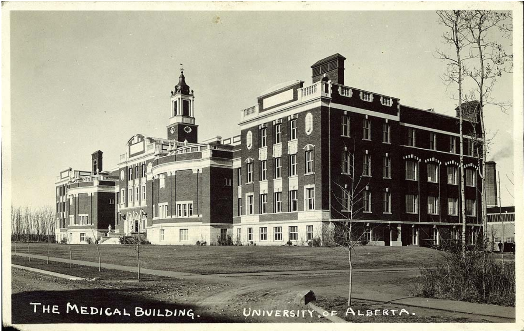
THE MEDICAL BUILDING.