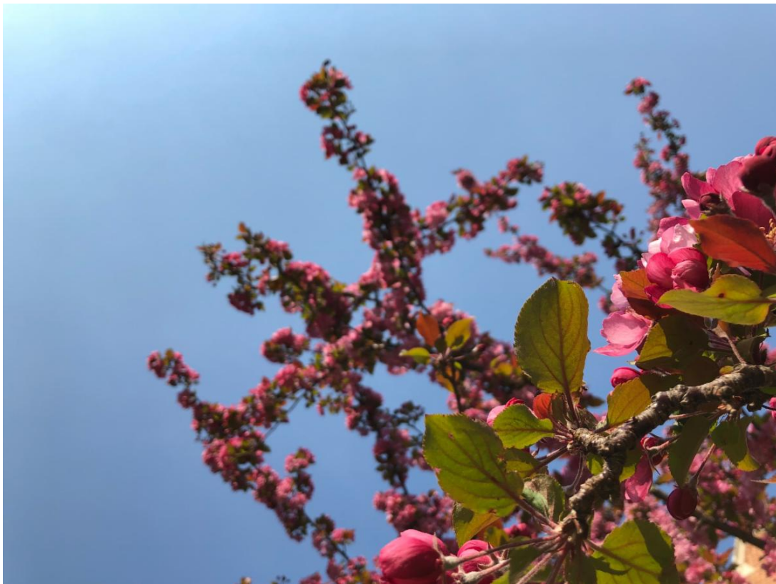
Spring flowers outside of SJC