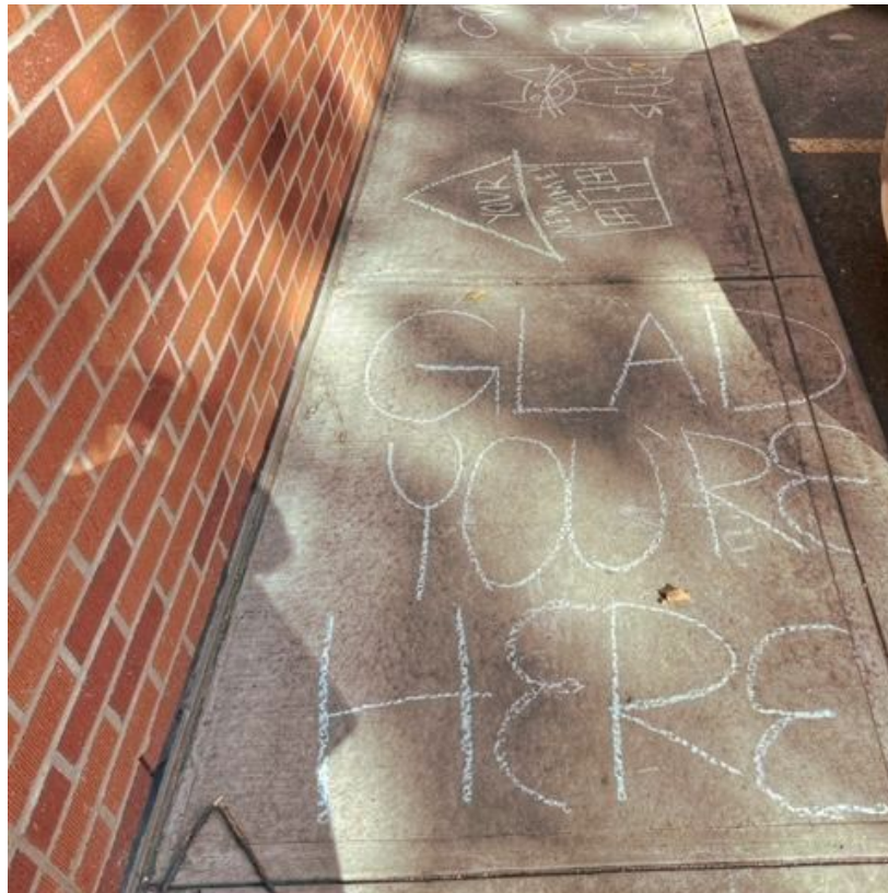
Sidewalk chalk drawings welcoming SJC Residents to campus.

National Day for Truth and Reconciliation September 30, 2021