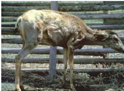
Figure 1. Mule deer doe with CWD in Wyoming.