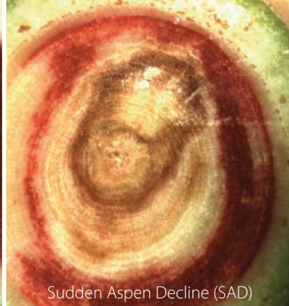
Sudden Aspen Decline (SAD)