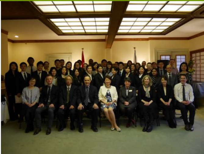
Participants at the Eighth JACAC Student Forum

areas such as teamwork, presentation, and research.