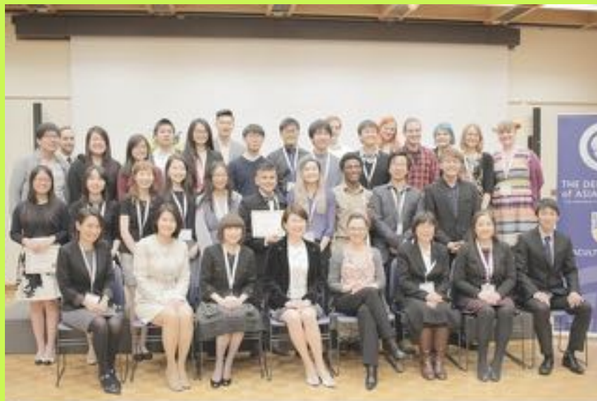
Participants of the 28 th Canada National Japanese Speech Contest

As of March 31, 2017, the book value of the endowment was $1,712,525.85 and the market value was $2,193,078.17. The spending allocation of the fund on April 1, 2017 was $63,135.36 with an opening balance of $189,388.66. Of this amount, $65,000 has been budgeted for spending in 2017-2018.