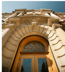
University of Alberta Edmonton, AB, Canada