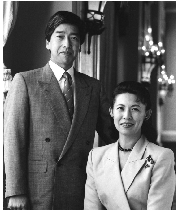
Their Imperial Highnesses Prince & Princess Takamado

ing of foreign cultures. These skills help students to think globally, preparing them to make the most of their opportunities in a competitive international marketplace.