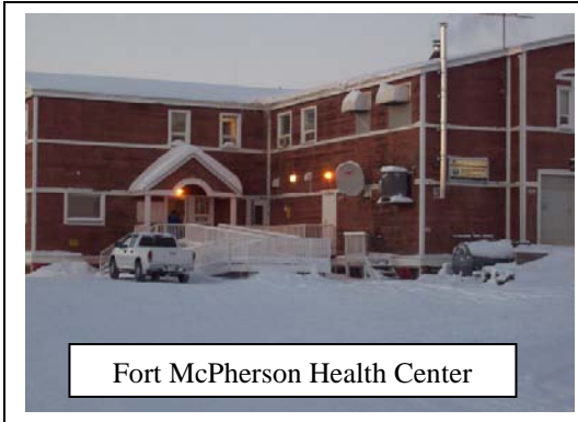
Fort McPherson Health Center