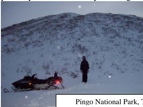
Pingo National Park, Tuktoyuktuk

Don't let cold weather scare you away! If you bundle up you can be out for hours and not get cold. And if you are brave and fortunate you may have the opportunity to take part in a wilderness survival course. Northern lights are spectacular when you catch them, and all you have to do is walk a few feet from the residence to have the perfect viewing area. If you are there in the fall, don't get fooled into thinking there is 24 hour darkness. While you may not see the sun, you will get at least an hour of twilight.