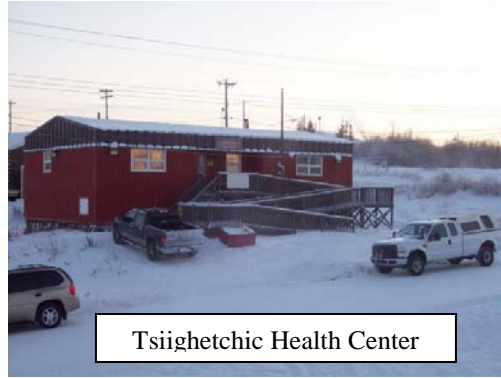
Tsiighetchic Health Center

Accommodation as available is provided in the hospital residence, which is a great place to connect with other hospital staff. Very few medical professionals reside in Inuvik, with many Locum's (rotational positions), along with medical residents from all over Canada. The residence is not a dorm, you are given an apartment, that has everything you could need. Including cable tv, dvd player, and telephone. The one and two bedroom suites have a full kitchen in them, though there are a few bachelor suites which are like a hotel room (no kitchen). As well the residence has free laundry facilities on each floor. Depending where your unit is in the building, can determine how great your wireless internet works. Though you quickly learn there is no such thing as fast or dependable internet in the residence, even if you are in the common room where the modem is. The common room is a great place to meet others working in the hospital. Often the place for potlucks and movie nights, everyone is welcome. There is also a shared kitchen Cell phones do work up in Inuvik, but be prepared to pay up to a 1.00$/min for roaming fees. I forgot to mention your commute to work is very short, a leisurely walk will take you just over a minute door to door and if you run 30 seconds should be ample.