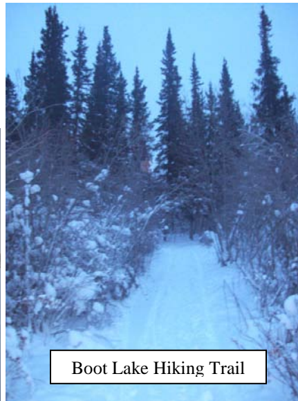
Boot Lake Hiking Trail

In regards to placement, you will be exposed to a multitude of conditions and experiences. Currently the only physical therapy clinic is located in the Inuvik Regional Hospital. But the clinic is unique, there are two full time physio's and between them they service twelve communities in the north, on top of treating patients in acute care, long term care and in the outpatient clinic. In the clinic patients are booked in 30 minute time slots, and as you build your case load you are responsible for your schedule and how you wish to book your clients and manage your time. Being that this is the only physio clinic in the region, there is also opportunity to deal with WCB claims.