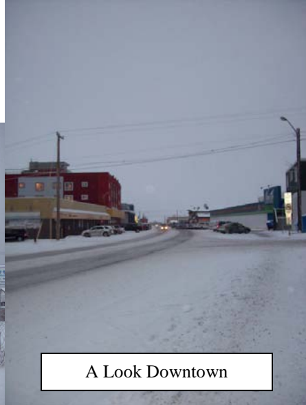
A Look Downtown

Don't let cold weather scare you away! If you bundle up you can be out for hours and not get cold. And if you are brave and fortunate you may have the opportunity to take part in a wilderness survival course. Northern lights are spectacular when you catch them, and all you have to do is walk a few feet from the residence to have the perfect viewing area. If you are there in the fall, don't get fooled into thinking there is 24 hour darkness. While you may not see the sun, you will get at least an hour of twilight.