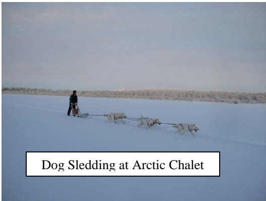
Dog Sledding at Arctic Chalet

Prior to choosing out PThER 520 placement sites, I really hadn't paid attention to communities in the Northwest Territories. Inuvik is located above the Arctic Circle and despite one may think, it's a vibrant community. The Midnight Sun Complex houses many things from a 24 hour gym, swimming pool and water slide to an ice rink with free skating times. Step outside the residence and you are 2 minutes from the Boot Lake hiking trail, 3km long, it's a fantastic hike. As well there always seems to be some type of gathering or community events taking place, if you want to get involved in the community the locals are more than welcoming. If you're up for sewing there is an opportunity to learn from a highly respected elder, traditional sewing and beading. I had plenty of time to sew my own rabbit skin mitts, but there is a variety of fur for you to choose from.