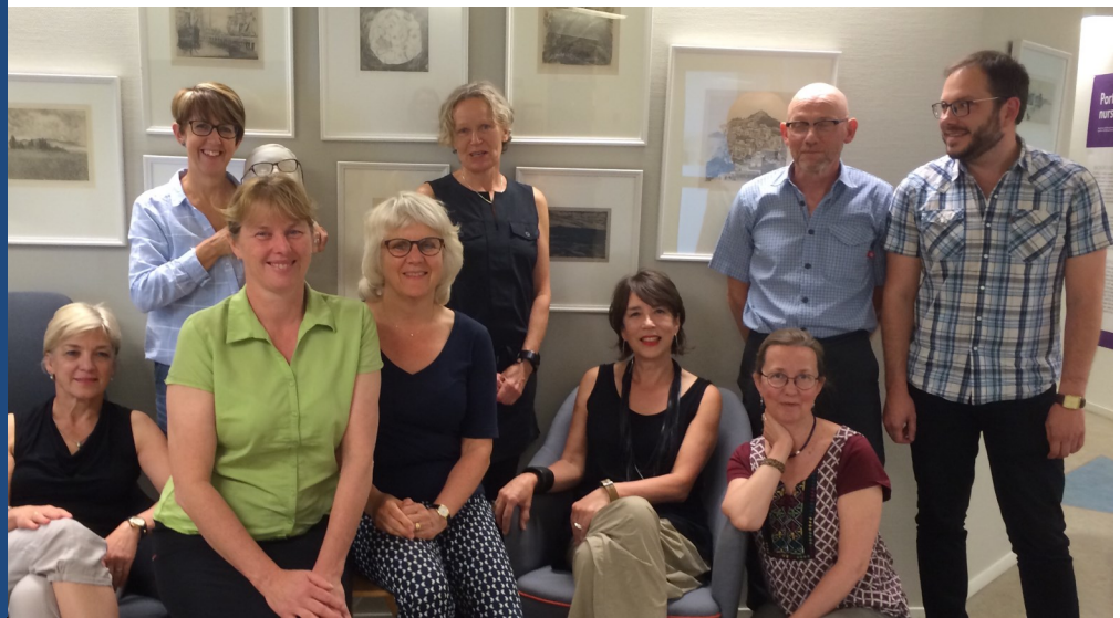
FLAME Group Falun, Sweden, June 2017

Next steps include a feasibility review by our steering committee of the almost 200 indicators that were retained through the Delphi rounds. The goal is to determine if and how the QIs could be implemented in the Canadian healthcare system to measure and improve the quality of transitions.