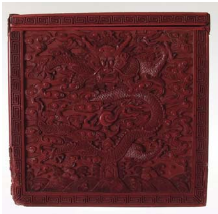
Detail of a scroll box for the Southern Inspection Tour scroll of the Emperor Qianlong, featuring the imperial symbol of a five-clawed dragon. (Qing 18th century.) Mactaggart Art Collection, Museums and Collections Services, University of Alberta Museums.