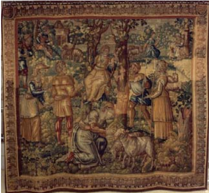
A seventeenth-century Flemish tapestry donated to the Clothing and Textiles Collection, Department of Human Ecology, and certified as cultural property.