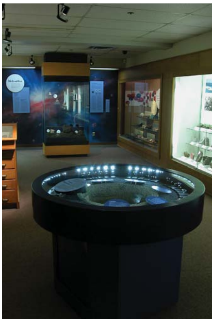
New exhibits in the Mineralogy and Petrology Museum, Department of Earth and Atmospheric Sciences: Diamonds in the Rough (foreground) and Meteorites (background).

The University of Alberta Museums is a collaborative organizational model that includes Museums and Collections Services (MACS), the Policy and Planning Committee, the Curators' Committee (representing the University's 35 distinct collections), and the Friends of the University of Alberta Museums (FUAM).