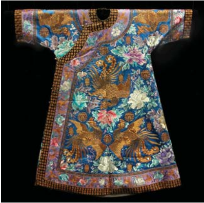
Phoenix robe of the Dowager Empress Cixi (Qing 19th century). Mactaggart Art Collection, Museums and Collections Services, University of Alberta Museums.