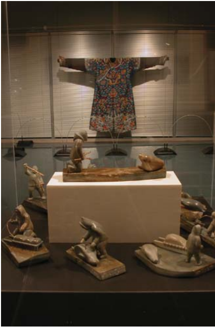
The University of Alberta Museums exhibition Grade 'A' Certified fresh in the Print Study Centre.

certified cultural property such as rare Inuit prints, exquisite textiles from the Mactaggart Art Collection, and specimens from the natural world.