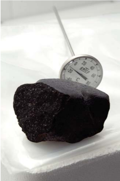
A 153g piece of the Tagish Lake Meteorite kept in a below-freezing environment. University of Alberta Meteorite Collection, Department of Earth and Atmospheric Sciences.