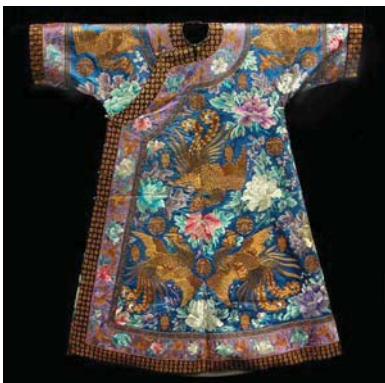
Dowager Empress Robe, c.1890, silk satin embroidered with metal threads.