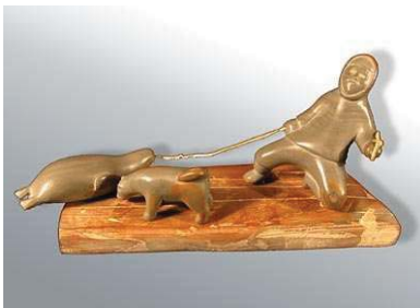
Sculpture depicting an Inuit seal hunt in eight parts by Pauloosie Akitirq

The Department of Museums and Collections Services worked with the Board of Governors to commission a formal portrait of