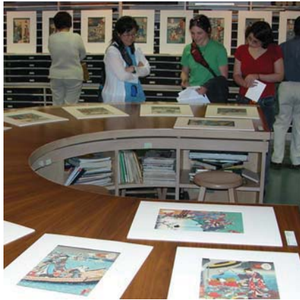
The prints of Kunisada II's Genji Monogatari portfolio displayed in the Print Study Centre, an interactive facility operated by the Department of Museums and Collections Services.