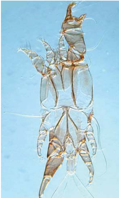
A male Dinalloptes chelionatus , a strangely asymmetrical feather mite from a double-crested cormorant from Lac la Biche. MACS introduced a new database component for mite specimens as part of the E.H. Strickland Entomological Museum database section and created a fast and easy way of entering records.