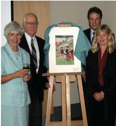
Special guests at the Friends' twentieth anniversary celebration flanking the 1861 Japanese print donated to the University of Alberta Art and Collection.

Edmonton Inspires II ran from 25th November to 18th December 2004 at the University of Alberta's FAB Gallery and featured not only a diverse selection of art, artifacts and specimens from a number of University collections, but also a series of engaging stories about the museum objects and their connection with Edmonton. During its run, Edmonton Inspires II attracted over 1,500 visitors.