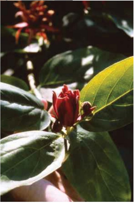
Calycanthus floridus (Carolina Allspice) Researchers in the Vascular Plant Herbarium are using these plants in their DNA isolation research.

The Pathology Gross Teaching Collection in the Faculty of Medicine and Dentistry is being used in a variety of educational and research projects. The Collection is used for undergraduate and postgraduate pathology training, and for the preparation of single case reports. In 1998/99 planning began for the development of a web interface for the searchable database of specimens in the Pathology collection.