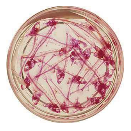
There are two types of stickleback shown here: Culaea inconstans and Pungitius pungitius - part of an ongoing research project. From the Museum of Zoology , Department of Biological Sciences.

In 1998, the University of Alberta adopted seven strategic initiatives to guide all facets of the University's operation as part of its Strategic Business Plan for 1998-2001. The museums and collections on campus, as critical components of University life, worked towards meeting these initiatives in diverse ways.