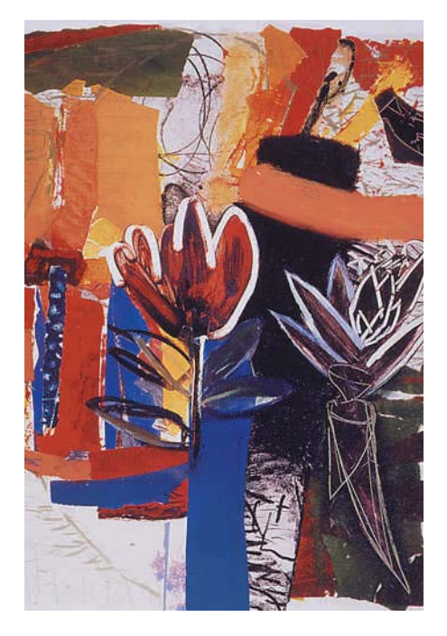
Flowers and Flowers (Some with Thorns), J.C. Heywood, 1999.