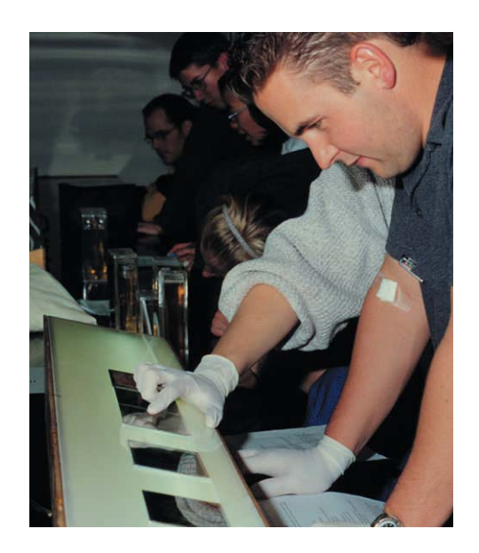
Top left and above : Students working with the Pathology Gross Teaching Collection .

Report of the Collections Committee 1998/99