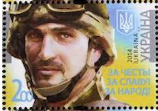
Recent postage, featuring a well known saper.