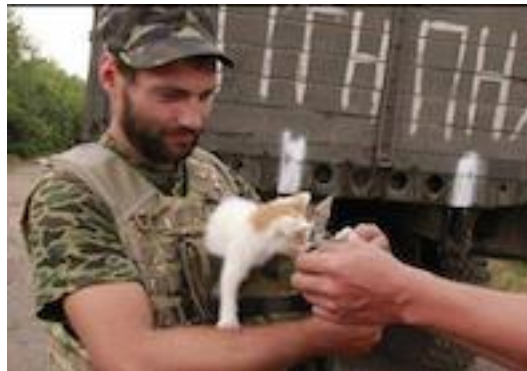
A Ukrainian soldier and his furry comrades.

N.B. There will be no final examination in this course.