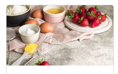
Preparing Your Course

CTL has a continuously-growing library of online resources for instructors to support their teaching (whether face-to-face, blended or online). We encourage you to use these resources as a starting point and to then request a consultation with an Educational Developer should you require more bespoke support.