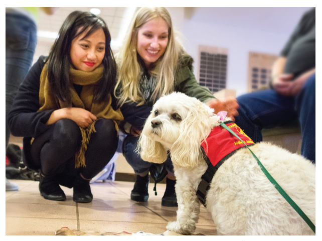
Chimo ATT event at SUB, "Puppy Therapy"

a function of factors such as fitness, nutrition, use of drugs or alcohol, access to medical care, and quality of sleep. Developing an environment where healthy choices are the easy choices can contribute to the overall physical health of a population. This means providing access to resources for physical activity, affordable, healthy food options, health information, quality health services, and comprehensive employee health benefits, including an employee and family assistance program.