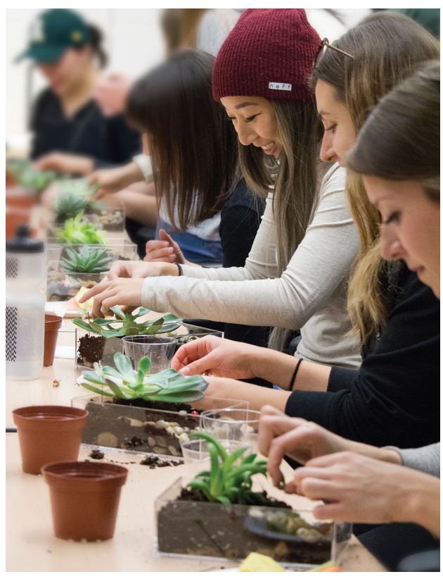
Build Your Own Terrarium Event 2017

regardless of age, ancestry, gender, gender identity and expression, sexual orientation, or any other protected ground at the U of A.