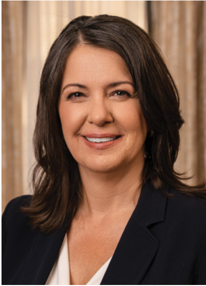
Honourable Danielle Smith Premier of Alberta

On behalf of the Government of Alberta, congratulations to the University of Alberta Class of 2024.