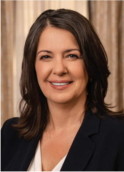
Honourable Danielle Smith Premier of Alberta

On behalf of the Government of Alberta, congratulations to the University of Alberta Class of 2024.