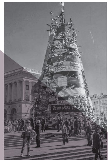
Caption: Maiden Tree, Kyiv

The final manuscript which was sent to Central European University Press (CEU) in early 2020 is about 300 pages in length. As this war is the most protracted conflict in modern-day Europe, and one that involves Canada, which has supported Ukraine strongly since the war's inception in the spring of 2014, the authors findings are of pivotal importance for Canada's relations with and policy in Ukraine.