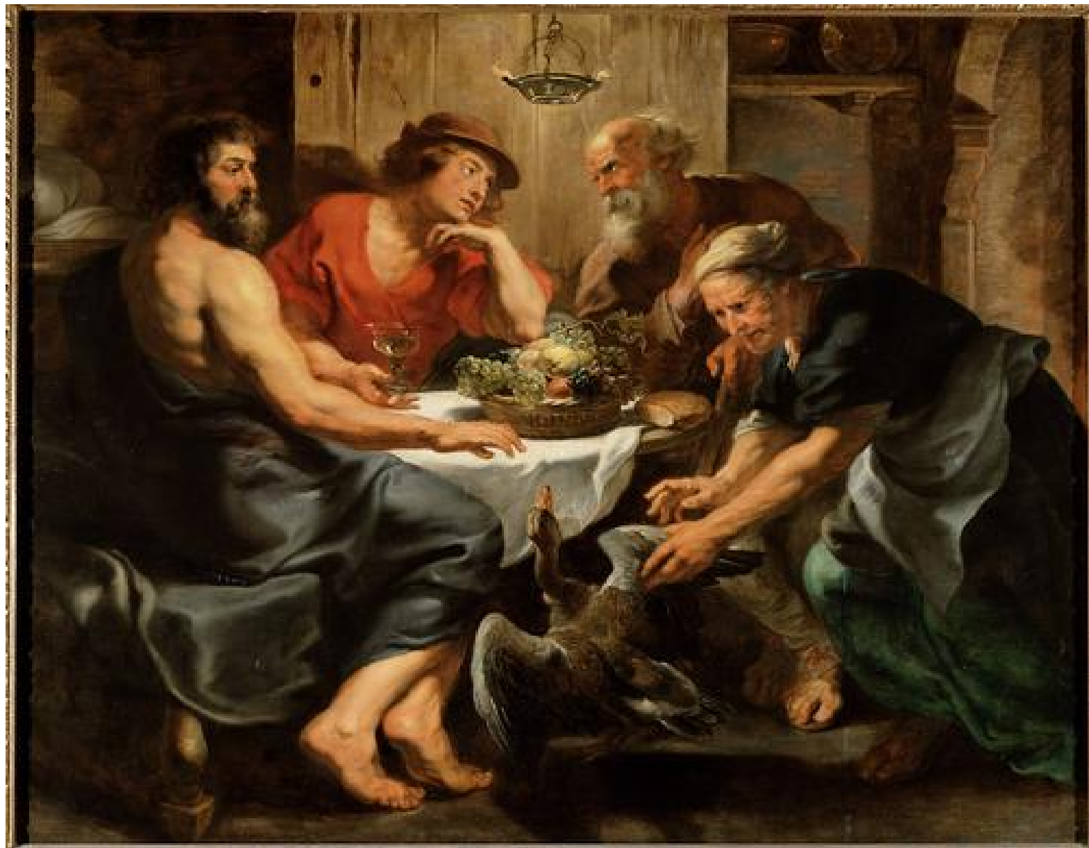
Jupiter and Mercurius in the house of Philemon and Baucis" by Peter Paul Rubens