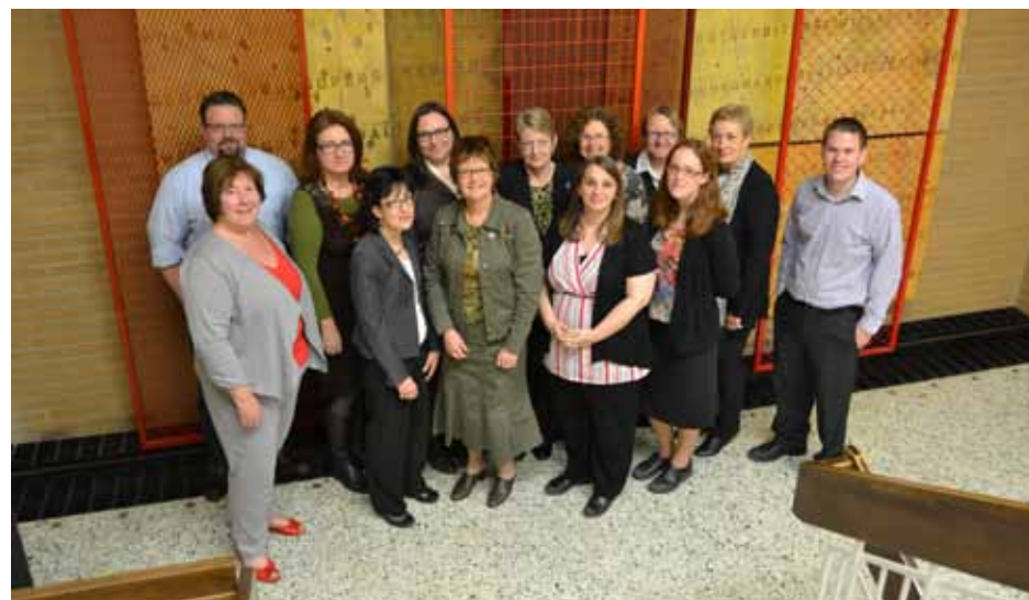
WUN team members meet in Human Ecology Spring 2013