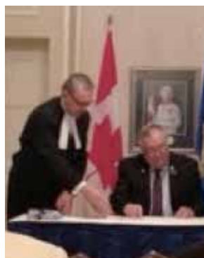
Lieutenant Governor Donald S. Ethell giving Royal Assent to bill passed by the Legislative Assembly