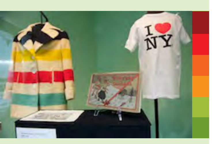
EXHIBIT ARTIFACTS WINTER 2012

These issues are examined through a combination of seminars and group work culminating in an end of term, student-produced gallery exhibit. This year's project, entitled "Greetings from ... exchanging cultural ideals through tourism" sparked a great deal of media interest - radio, TV and newspaper reports covered the opening. The exhibit showcased objects from the Department's Clothing and Textiles Collection as well as items that students and staff members collected during their own travels, including tourist T-shirts, musical instruments, and handcrafted artifacts. These artifacts were collected to explore the relationships between objects, places and the travelers who collect them.