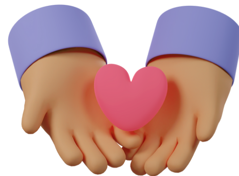
Graduate Student Assistance Program (GSAP)