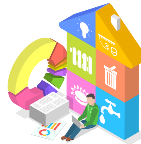
Subsidies to the Academic Success Centre, the Career Centre, and the Campus Food Bank (founded by the GSA)