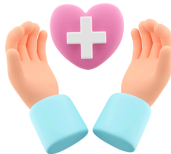
GSA Health and Dental Plan