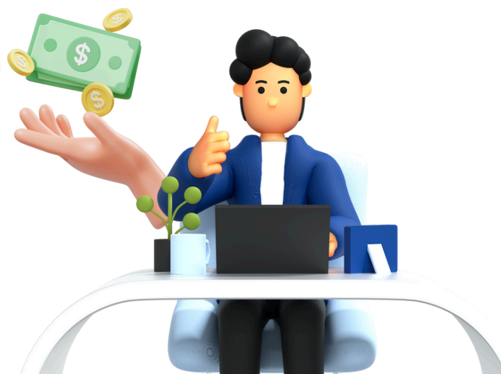
Grants, Bursaries, and Awards