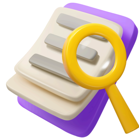
Collective Agreement and Advice