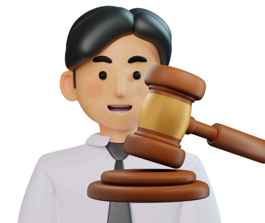
Graduate Student Ombudsperson