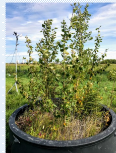
Mesocosms can support native species.