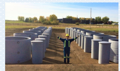
The above ground mesocosm facility offers a near field scale research opportunity with 16 main tanks and 32 ancillary tanks.