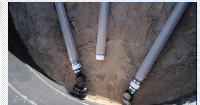
Drainage pipes over tailings sand installed in a mesocosm.

Instrumentation options include: time lapse and plant root cameras, lysimeters, piezometers, temperature, conductivity and moisture sensors, soil gas flux measurement, and more. Modular configuration allows for custom placement of main and ancillary tanks; more tanks can be added, depending on needs.