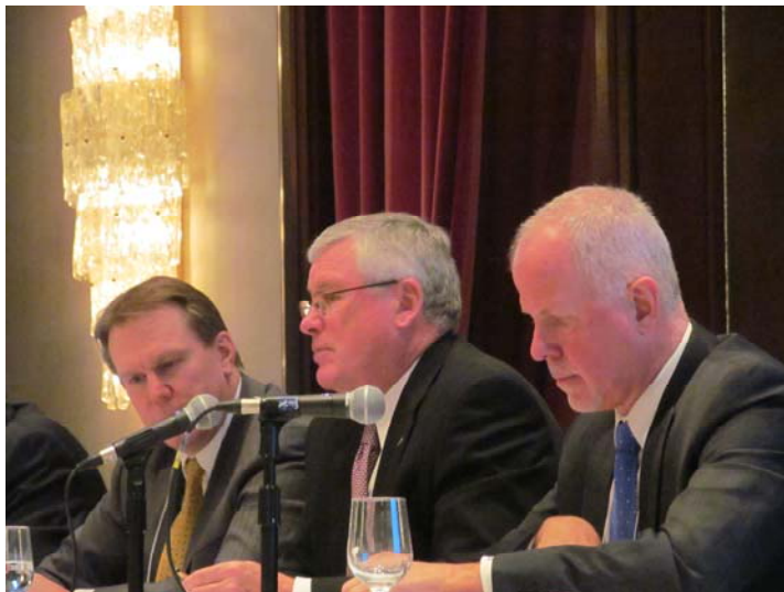
May IPE Conference