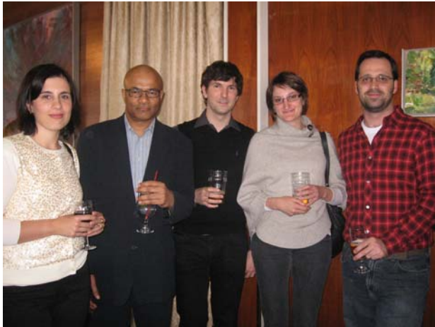
Farewell April 14