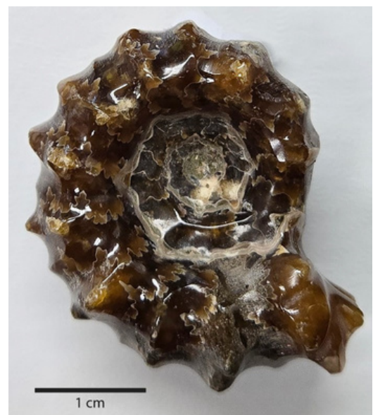
Dovilleiceras mammillatum (Ammonite) (Madagascar)