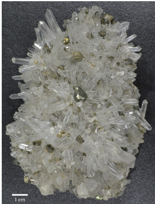
Quartz and Pyrite (Peru)

A few examples of the donated specimens are shown below: