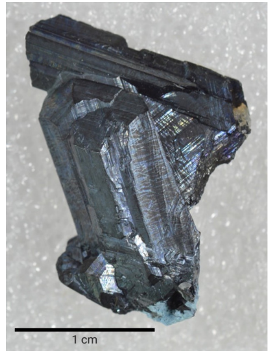
Chalcocite (Cornwall, UK)