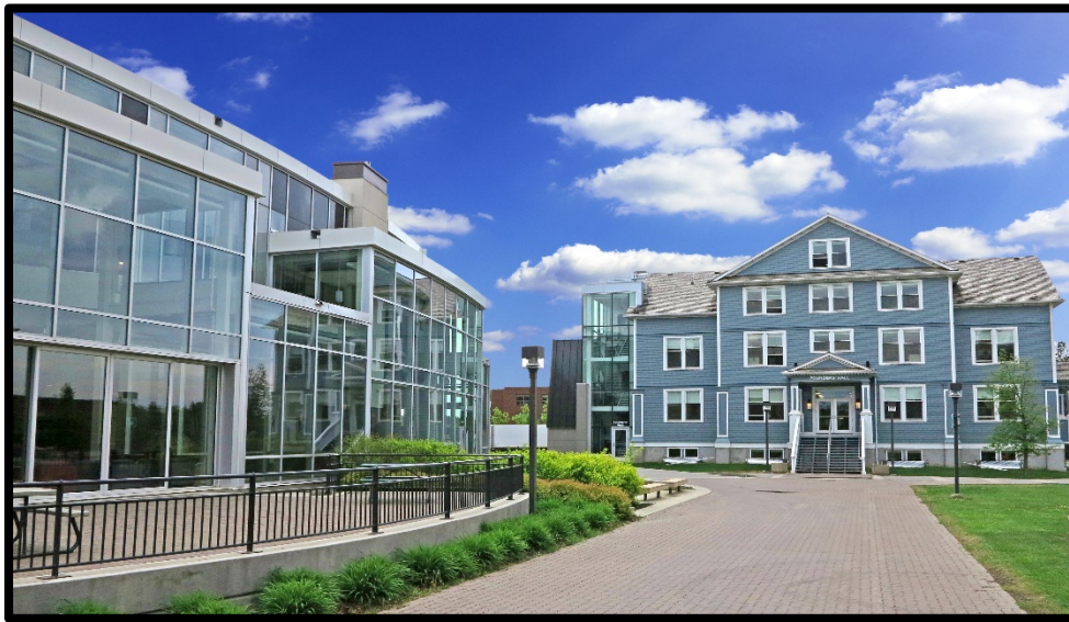
University of Alberta – Augustana Campus

Addressing issues of religion and politics is never without controversy, especially in an election year—indeed, these are the topics we’re told never to bring up around the dinner table. But despite the controversies and ever-present political divisions we see in our communities, we at the Centre sought to foster rich public dialogue about these issues in the 2018-19 academic year. And we will continue toward the goal of fostering impactful dialogue, supporting new research and offering public programming related to religion and public life, in the year to come. We thank you for your support, and we look forward to seeing you at Augustana in 2019-20.