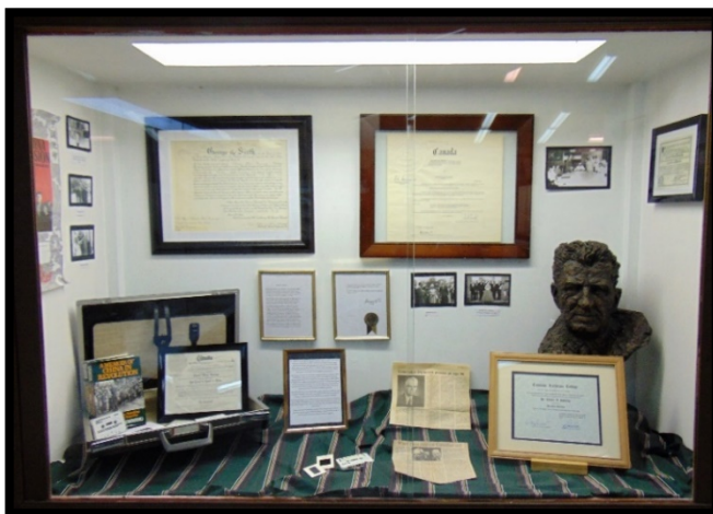
Chester Ronning exhibit at the Camrose & District Centennial Museum

Video recordings of Ronning Centre events can be viewed on our YouTube channel: www.youtube.com/user/ronningcentre