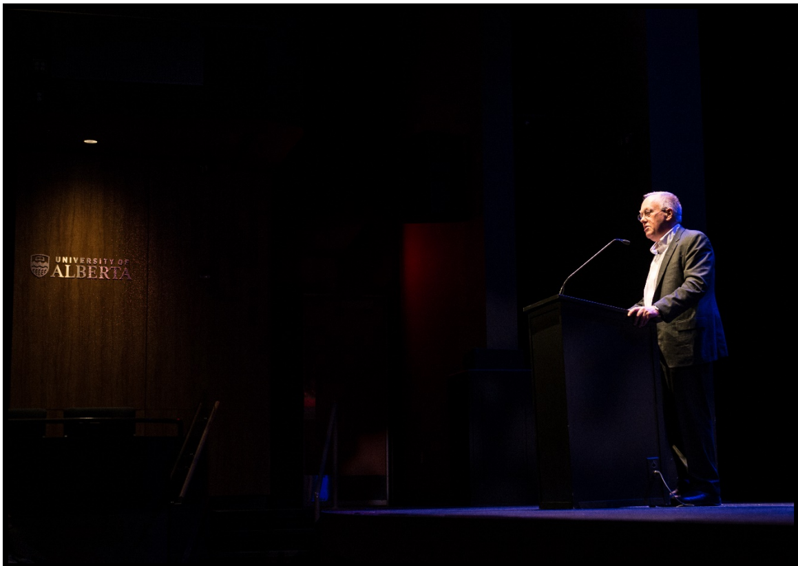
Chris Hedges, "Religion and Public Life in Today's Global World"

Centre Publications, Presentations, and Projects – 17