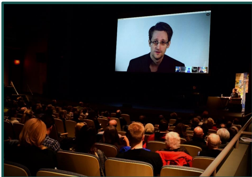
Edward Snowden addresses 1,500 people via live-stream Winter 2018

Via live-stream, NSA whistleblower Edward Snowden discussed perspectives on security, public life, and research. How we perceive religious practitioners and the way political policies intentionally target their communities influences our opinion on the appropriate uses and limits of mass surveillance. Is it possible in an age of mass surveillance to have a public life that is democratic, safe, and in which all people have freedoms of religious expression without prejudice?