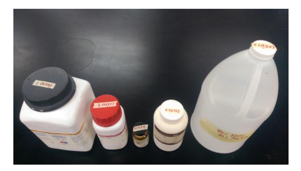
The tape has the CHEMATIX waste card number and group name written on them