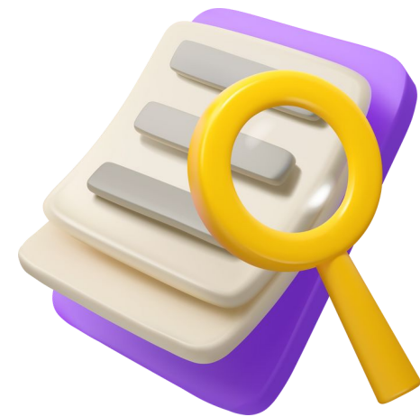
Collective Agreement and Advice