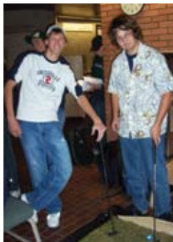
BSA Charity Mini-Golf Classic in the Business Building

THE BSA HAD BARELY KICKED OFF THE START TO THE NEW SCHOOL YEAR and already an intense competition had begun for the coveted CGA Cohort Cup. Only in its third year of existence, the CGA Cohort Cup pits second-year students who belong to seven separate groups against one another in a year-long battle, modelled after the House system in Harry Potter.