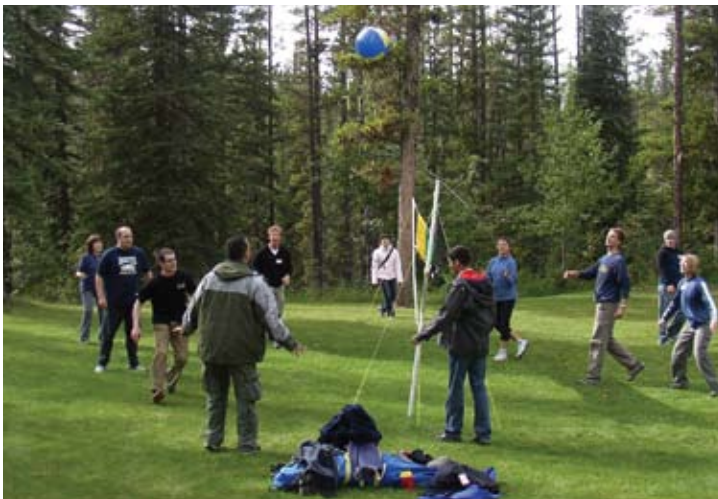
Annual Blue Lake Retreat in the mountains

Participation in Intramural Sports has again increased with 53 students releasing stress and having fun on nine teams representing the MBA program in seven sports. The MBA continues to have one of the highest participation rates in intramurals of any faculty on campus. Planning for case competitions is well underway as our student body now has the daunting task of maintaining the international reputation that we have earned through our success over the past few years. The Gay and Ralph Young Case Competition, hosted by the MBAA, took place on Saturday, November 19 at the Alberta School of Business. The 2005/06 MBAA Executive Team has done a tremendous amount of work to maintain and build upon the standards that were set by our predecessors; this is something that we hope is evident in the quality of service we provide to our student body.