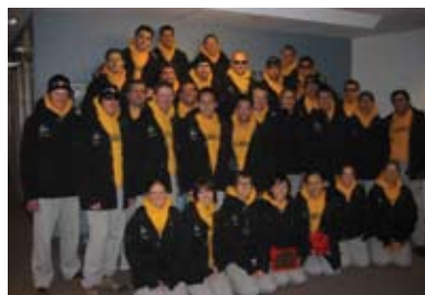
MBA Games Team