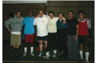
Intramural Soccer Team

The MBA Association has managed to remain quite busy this year. From a text book exchange to our Annual Thanksgiving Celebration, the MBAA continues in its attempt to enhance and maximize the student experience.