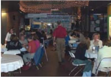
Café de BSA

President, Business Students' Association, 2005-2006