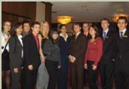
Student Ambassadors welcome guests to the 17th Annual BAA Dinner.