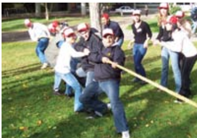
Cohort Olympics: Business Quad