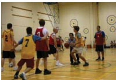
Intramural Basketball Game