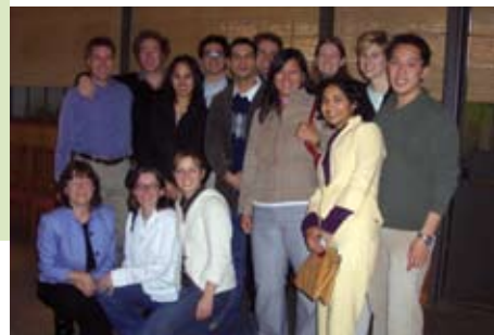
NET IMPACT students in San Francisco with alumni