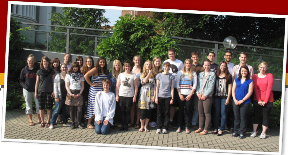
Thanks to the generosity of our donors to the CSSG scholarship and University of Alberta International, all of these students received funding to help them attend CSSG 2013!