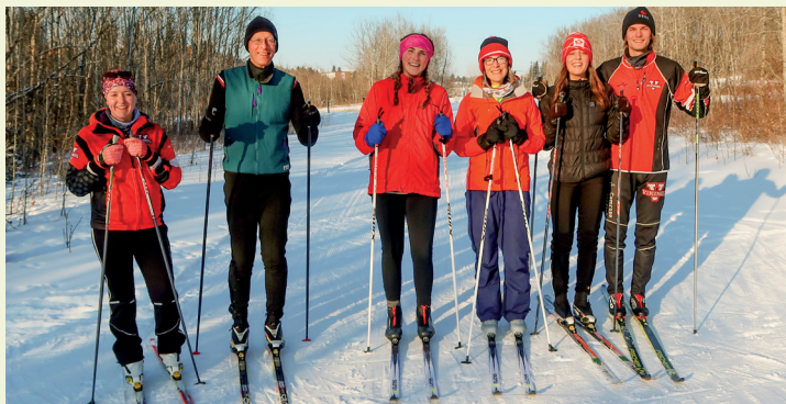
Even the windchill couldn’t keep these folks off the trails after the dedication.

As the program is in its initial season, this lending library is currently only available to Augustana students, staff and faculty. All participants must attend a short, one-time only orientation session with Campus Recreation staff to size their gear and learn the basics of trail safety and etiquette. Campus Recreation and the Vikings Nordic Ski Team also provide opportunities to learn or brush up on their cross-country skills through their weekly learn-to-ski programs and their informal ski meetups.