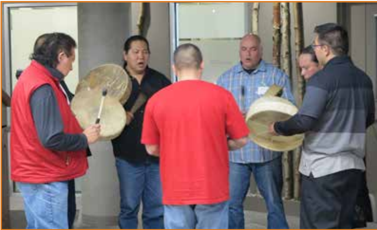
Drum group Sakaway from the Pê Sâkâstêw Centre in Maskwacis, Alberta, perform at the Grand Opening of Wahkohtowin Lodge

“In the future, we plan to house events and workshops tied to reconciliation and decolonization. Augustana will serve as a home base for programs to support Aboriginal students interested in post-secondary education and will welcome guest speakers to address a range of topics important to fostering multicultural understanding and relationships among diverse peoples.”