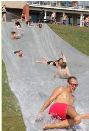
Discussions with faculty members during Opening Convocation and the annual Slip and Slide with the Dean are two ways Augustana already welcomes new students.