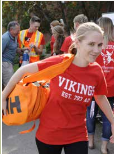
O-Team members welcome new students and ferry their stuff into their rooms in minutes!