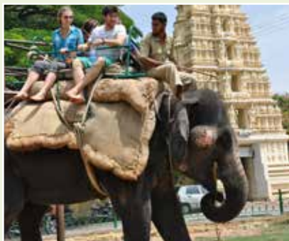
Three-week blocks could be used for international study opportunities around the world.