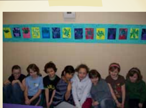
The Girl Power group at Sparling School helped girls learn about topics like body image, hygiene, and nutrition with the assistance of Augustana students.

“I'm really grateful to those teachers because they really went out of their way to allow our students in their classroom knowing it wouldn't always go smoothly. That opportunity was tremendous. I think it really was a win-win all the way around.”