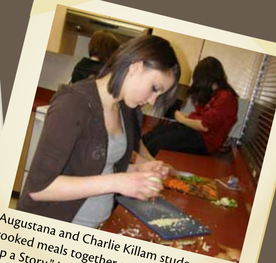
Augustana and Charlie Killam students cooked meals together as part of "Cooking Up a Story." Later they were joined by parents for a community meal and activities.