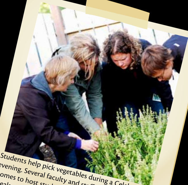
Students help pick vegetables during a Celebrity Chef evening. Several faculty and staff opened up their homes to host students where they prepared and ate meals together.

The food initiative has also benefited in 2008-9 from a $150,000 gift from Berta Briggs.