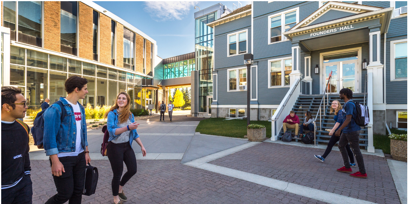
Founders' Hall, Augustana Campus.