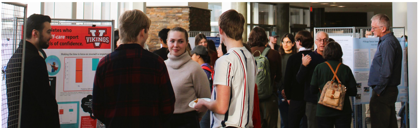
Students presenting at Augustana's Student Academic Conference, December 2022.