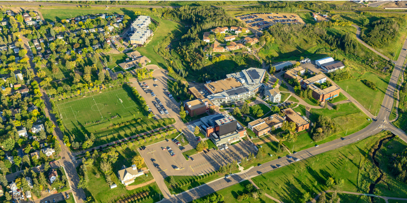
Aerial view of Augustana Campus and surrounding area, Camrose, AB.