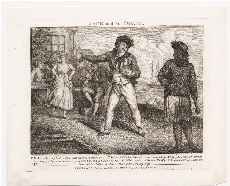
Figure 1. 'Jack and his doxy.' Published 20 October 1800 by Laurie & Whittle, London. Lwlp10030

Long trousers also defined commoners, signalling that the wearer was someone to command, low in status, possibly an artisan with his own occupational affiliations. Philippe Ariès claims that trousers signalled 'collective craft identity' in eighteenth-century France and Daniel Roche notes their use in urban settings as well as among sailors and river men in that kingdom. 12 This social marker was apparent in many European maritime communities, including Britain and its hinterlands. Information survives in detail about the garments prepared for sea-going men and it is clear that mariners' clothing shared common visual and design elements with those of other working men – indeed, the garments (or slops) stocked on board naval and merchant vessels from the 1600s were largely interchangeable with clothes worn by men on shore. But in one respect, sailors' clothes were distinctive, for they were ready-made.