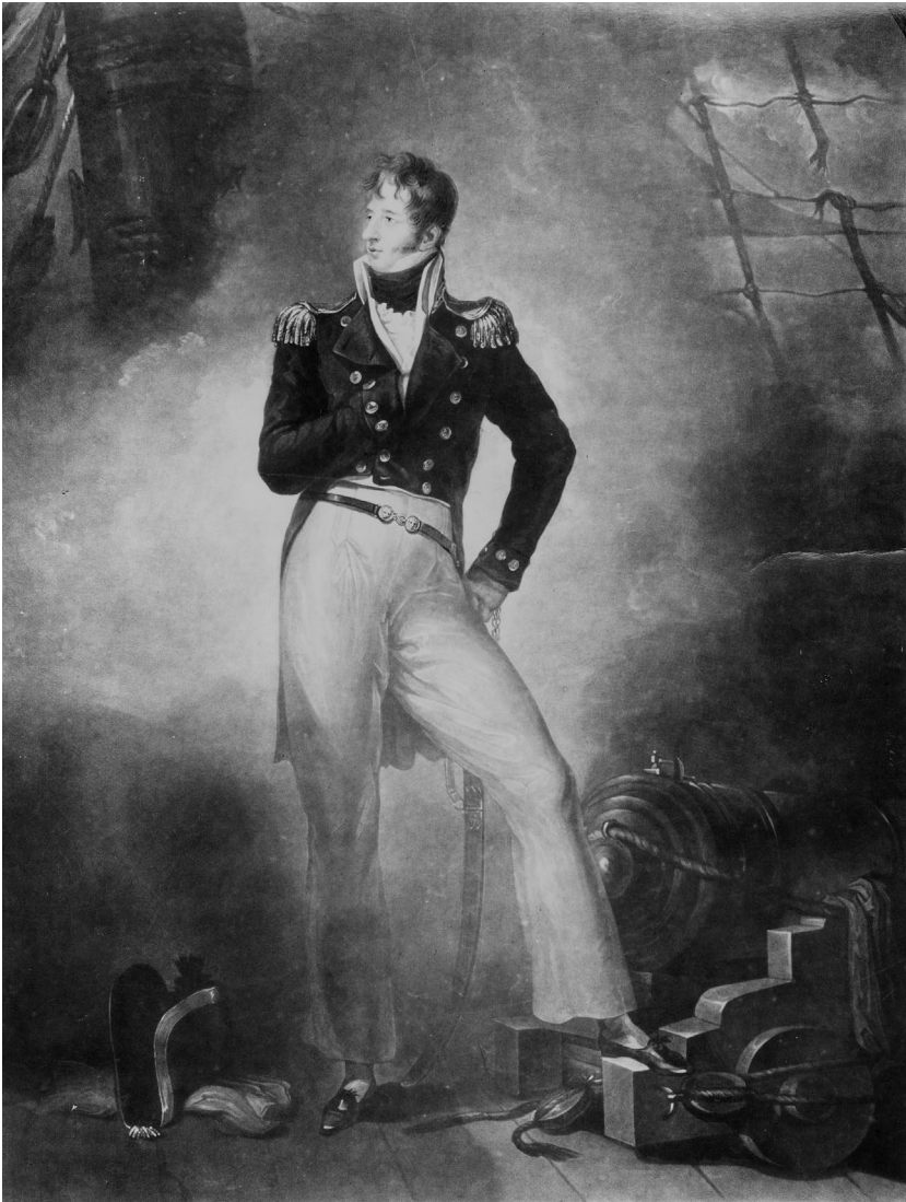
Figure 5. Admiral Thomas Cochrane, 10th Earl of Dundonald, by Peter Eduard Ströhling, 1807, engraved by Charles Turner, 1809. SW00094330.

By the late 1700s, most sea officers reflected what we might call ‘anti-fashion’ in their apparel, rejecting the excesses of effete dandyism. A naval officer recorded his approbation of the norms of naval dress in verse, characterizing this style as: ‘Such Clothes as grace the Man! not useless Beau!’ 94 This aesthetic defined a new style of imperial masculinity at odds with the excesses of courtiers, even if the Admiralty still demanded breeches on occasion. This was part of a wider rejection of the stilted formality of the old order, evident even among denizens of the diplomatic corps. Similarly, from the mid 1700s onwards, many youth of genteel and noble backgrounds rejected the polished performance of the ancien régime , despising its studied politeness. What the older generation termed ‘grossly casual’ manners became a hallmark of noble youth and their acolytes. 95 These young men looked to plebeian