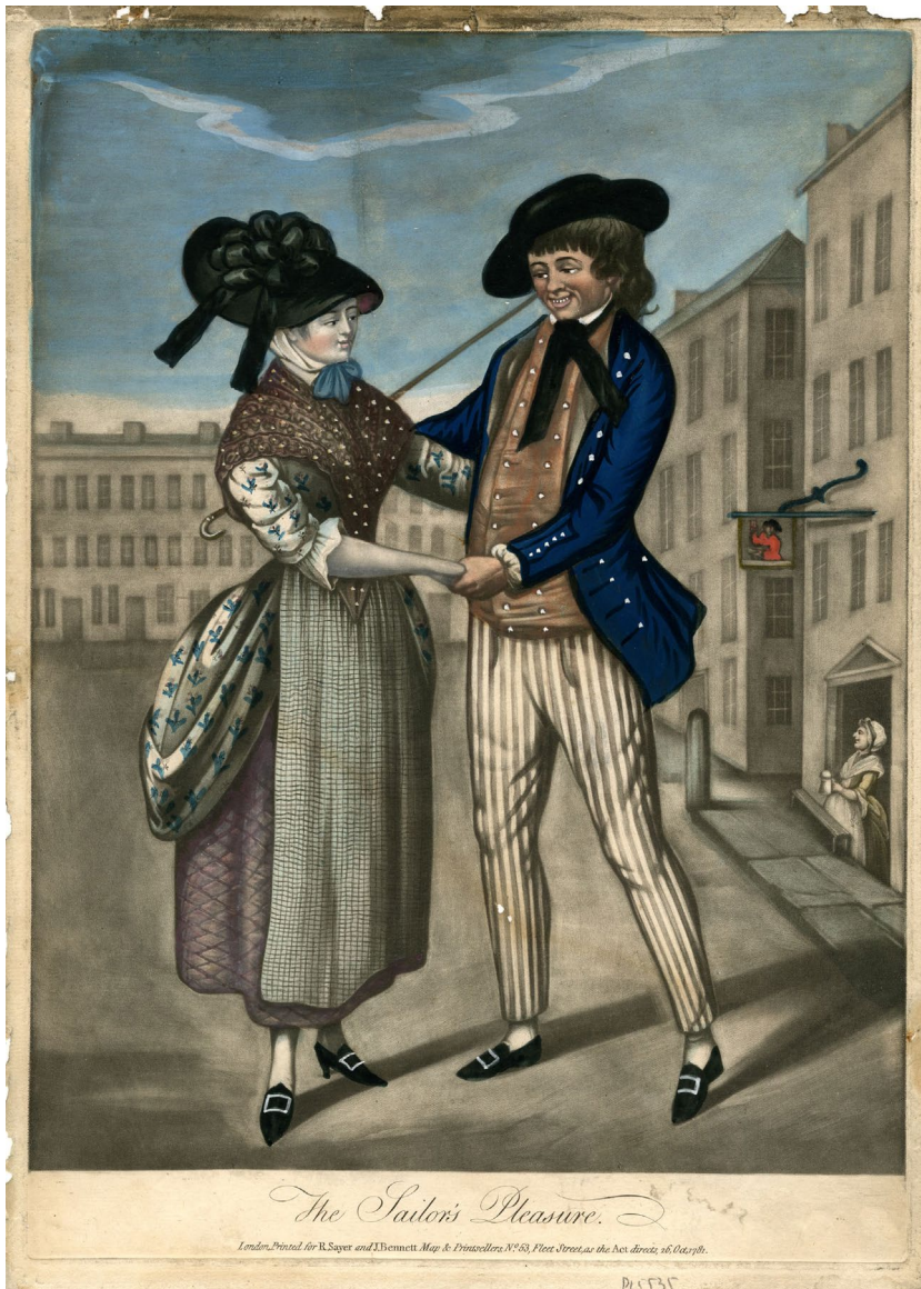
Figure 4. 'The Sailor's Pleasure', 1781. Published by Sayer & Bennett. 2010,7081.3208.

and rationality figured in the use of these garments by the officer class. Evidence of change appears in the inventories of genteel midshipmen setting out to sea. In 1704, an elite young midshipman listed '2 pair of drawers good' and '4 Sea Shirts' among a mixed assemblage of apparel and accoutrements in his sea kit. This list extended over several pages, with fashionable items predominating: wigs, powder bag for the wigs, fur cap, breeches, combs and innumerable shirts, ruffles and stockings. 74 In contrast, in the 1780s, six pairs of trousers were deemed indispensable to an ambitious midshipman, against only two pair of breeches for formal occasions. 75 Many officers began their lives at sea in humble positions, as a naval