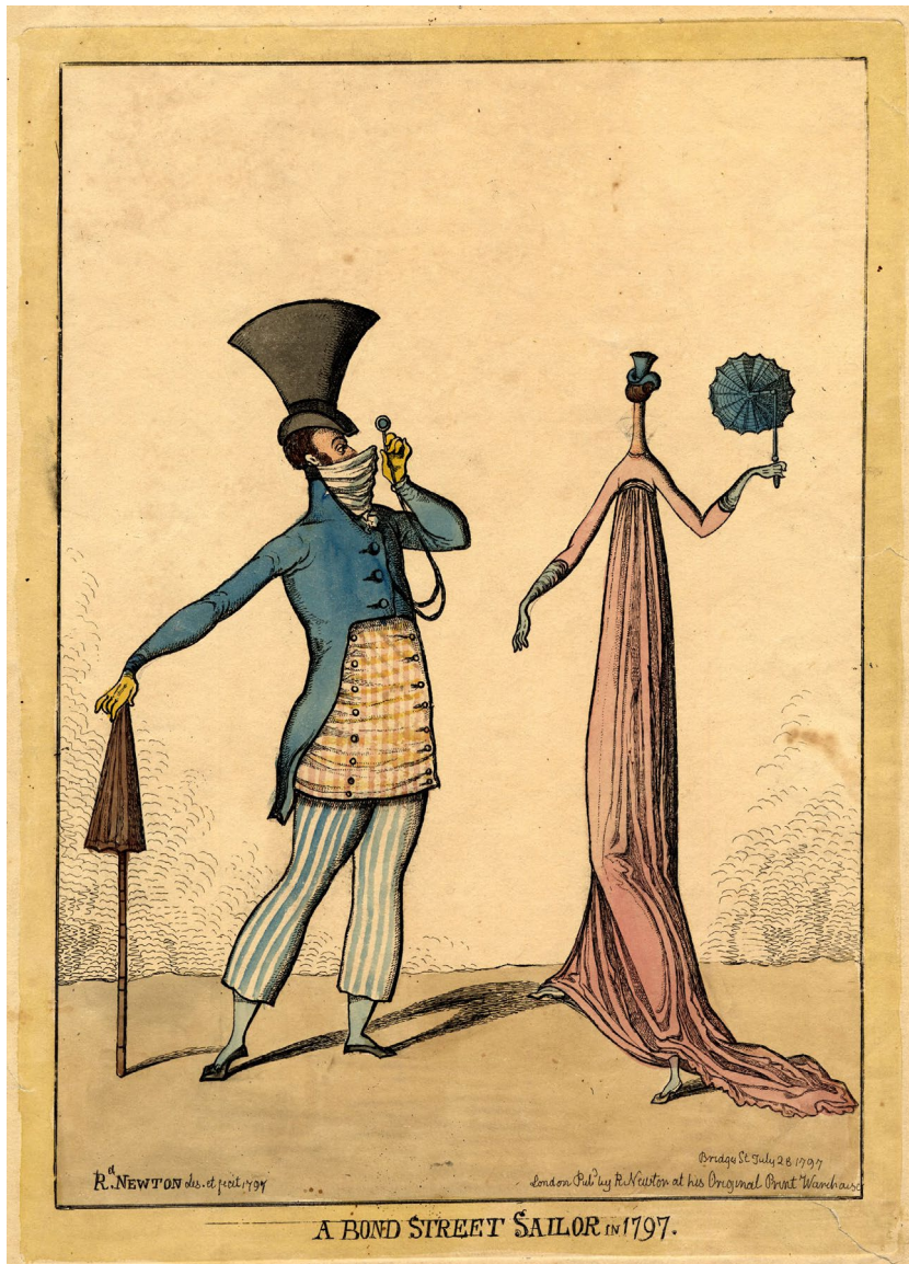
Figure 6. 'A Bond Street Sailor in 1797'. Printed by Richard Newton. 1948,0214.1002.

exemplars for skill, strength and daring, celebrating coachmen and jockeys. 96 Mariners were another admired set of men, uniquely entwined in imperial contests.