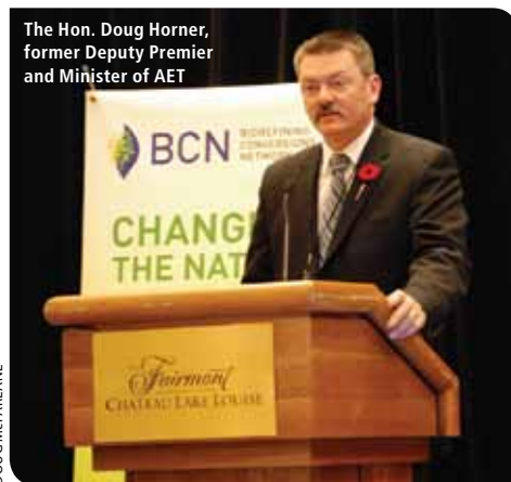
The Hon. Doug Horner, former Deputy Premier and Minister of AET