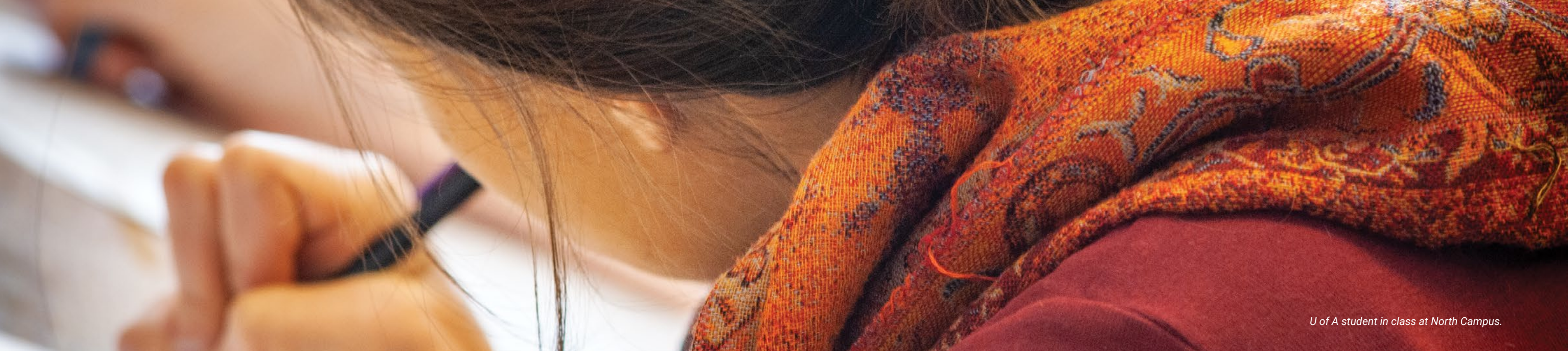
U of A student in class at North Campus.