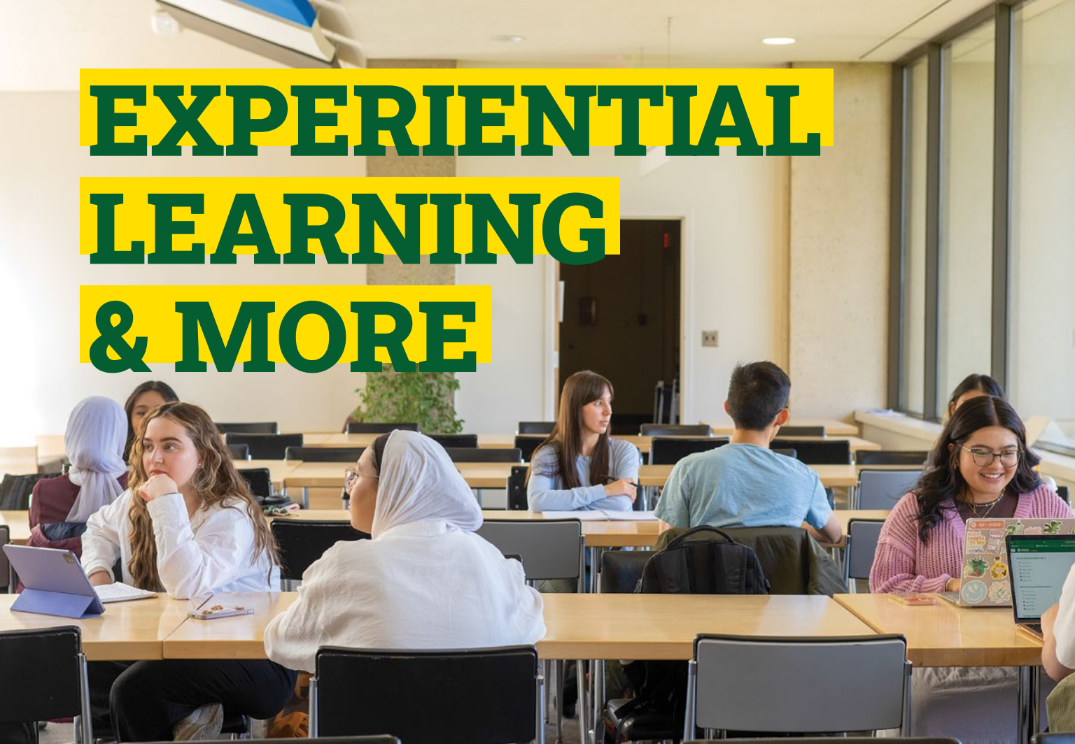
U of A students studying in a student lounge at the U of A.