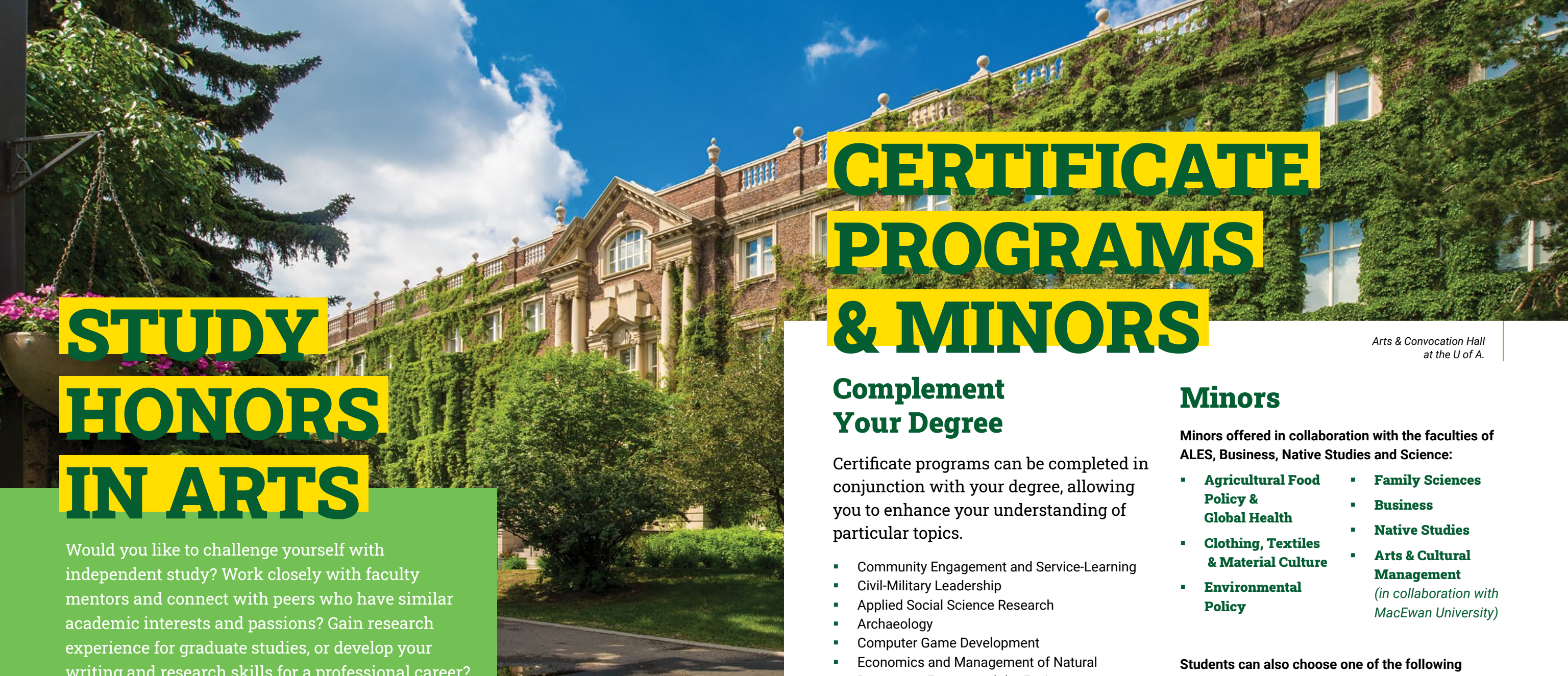
Arts & Convocation Hall at the U of A.