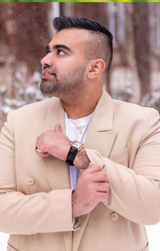
Arts students outside the Humanities building at the U of A.