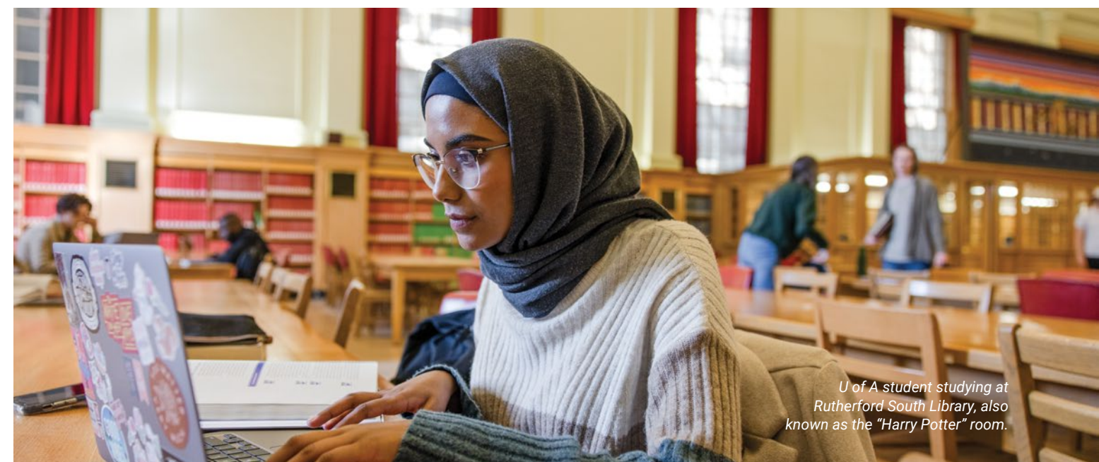
U of A student studying at Rutherford South Library, also known as the "Harry Potter" room.