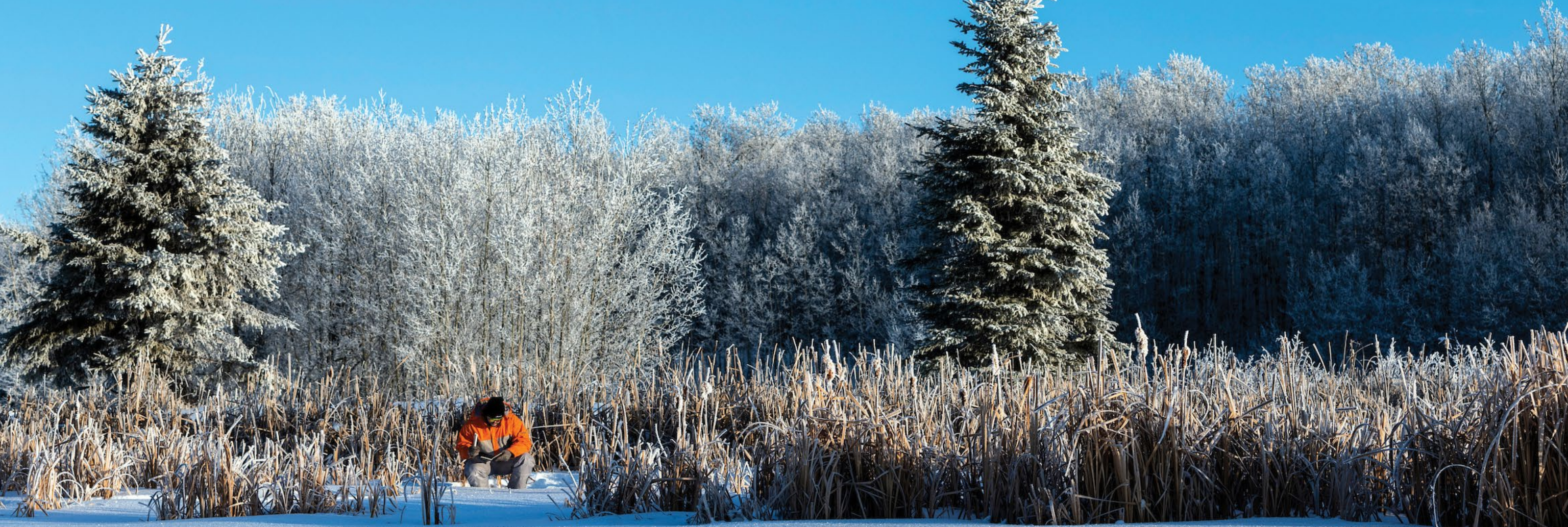
400-level field course at the Miquelon Lake Research Station. The course develops advanced skills for field studies in environmental science and ecology.