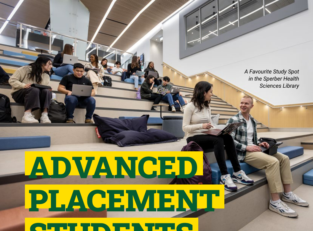
A Favourite Study Spot in the Sperber Health Sciences Library