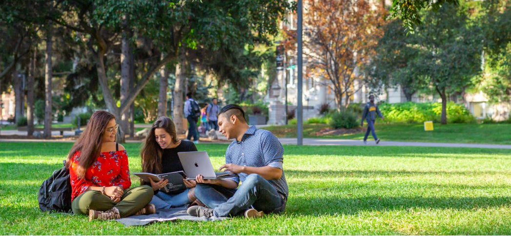
MAIN QUAD | NORTH CAMPUS