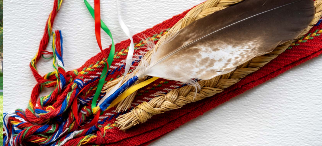
FIRST PEOPLES' HOUSE | CULTURE AND CEREMONY