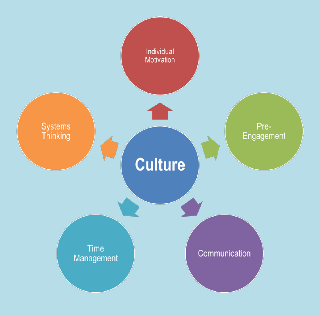
Figure 2. Prioritization of the 5 themes by importance to participants

Figure 1.Overarching theme of building a culture of engagement and the individual themes that build that culture